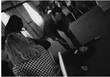
The theme for this year's Halloween show will center around 'American Horror Story.'

Oct 21, 2015 | 414 views | 0 comments | 12 shares